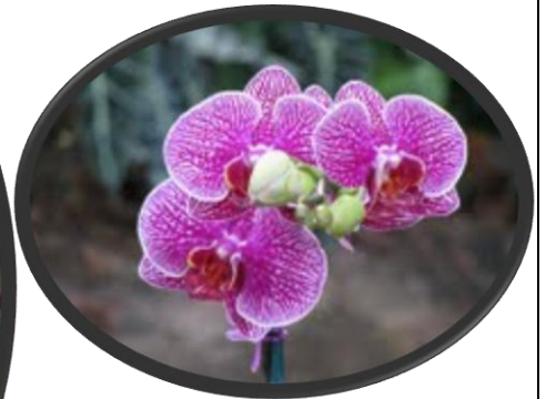
Jim Sandham Photo