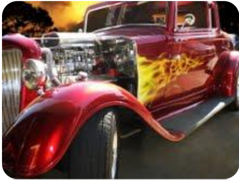
Art Rothenberg Photo