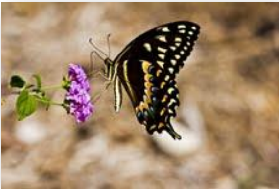
Craig Loomis Photo