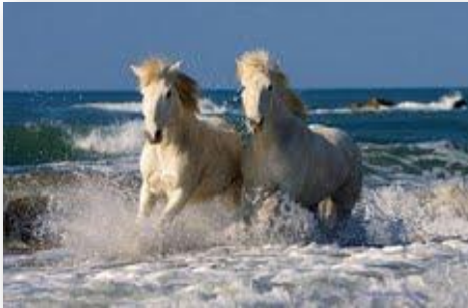
Judith Tooth Photo