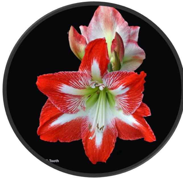
Judith Tooth Photo