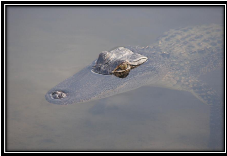
Jim Fallon Photo

Make sure you get to Don's meeting for updates on all the "latest and greatest" software and internet information. Also check out the Software/Internet archives on the 1960 PCUG website. Don has many resources and articles for your use.