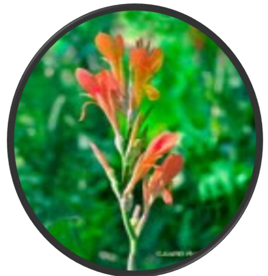
Judith Tooth Photo