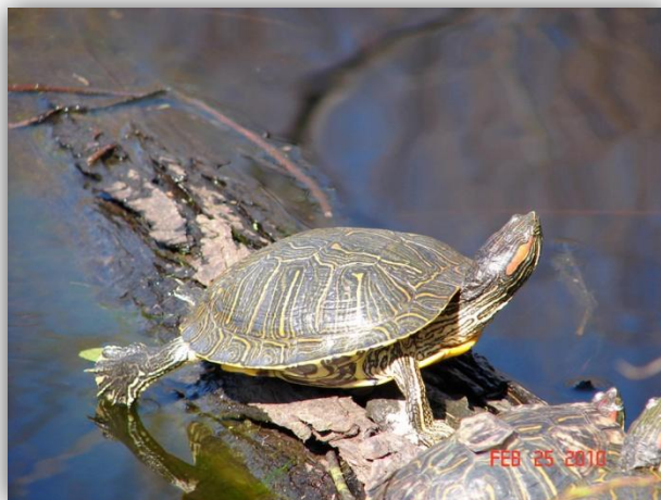
Don Bova Photograph