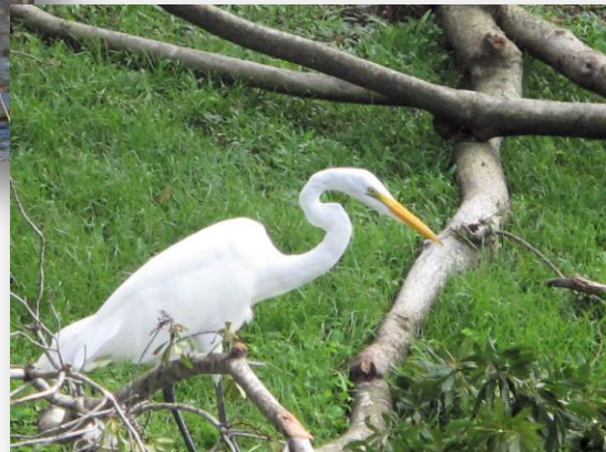
of Great White Egret