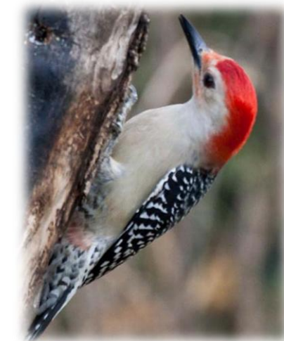
BeaAnn Kelly Photo