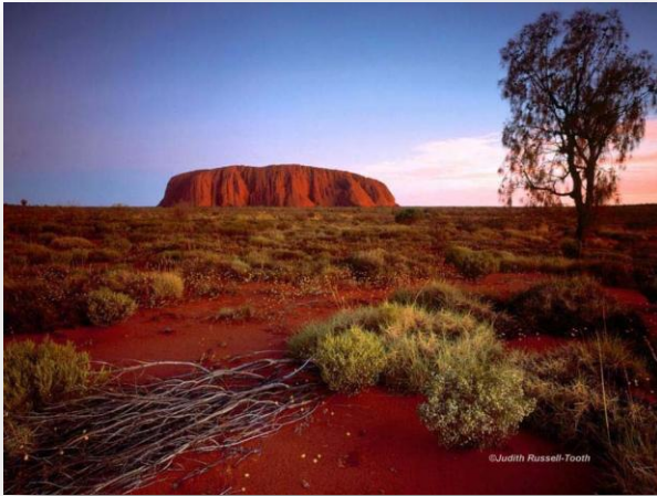
Judith Tooth Photo