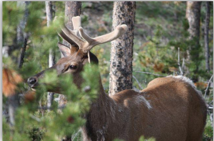
Dale Elliott, Photographer