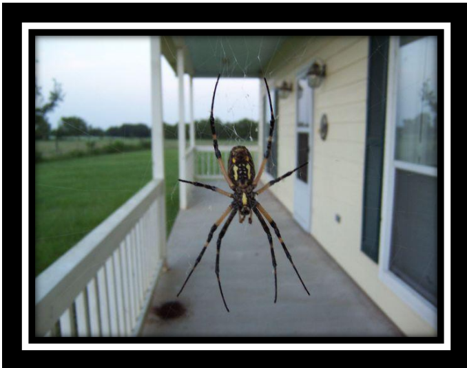
Erwin Winkel Photograph

One of the basic objectives to the Software/Internet SIG is to look at current issues that can impact us and our computers. Malvertising is one current one that we need to become aware of and how to avoid it.