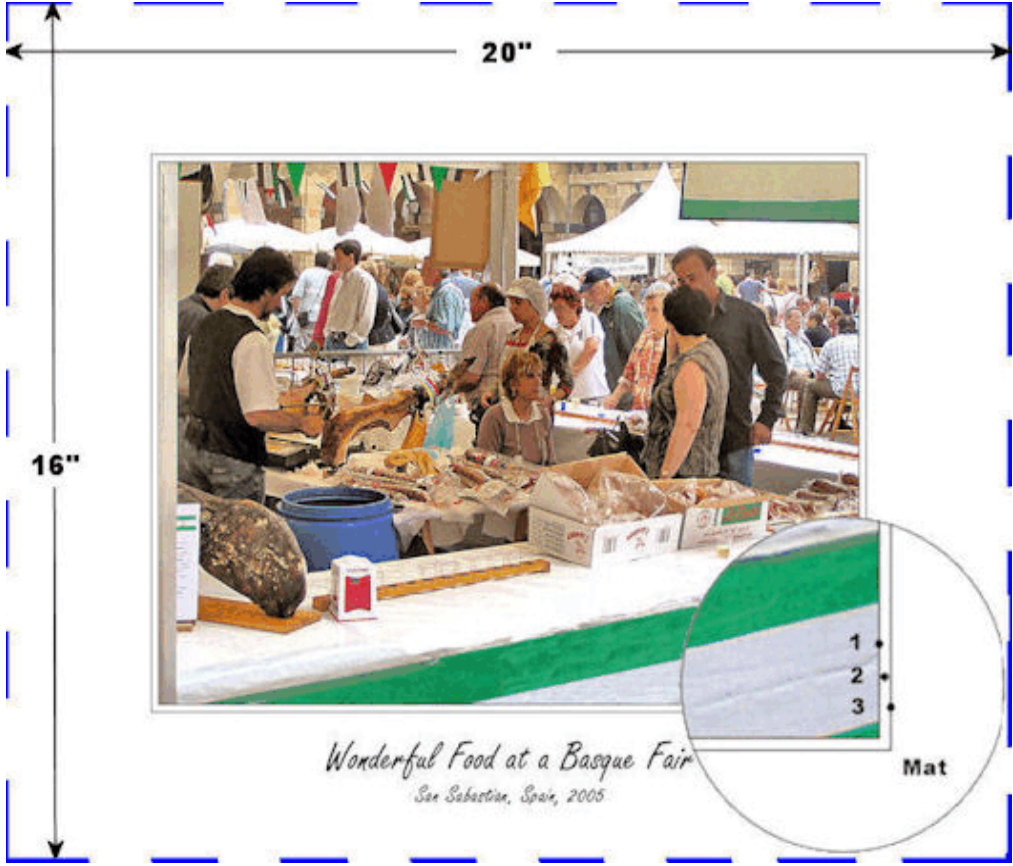
Wonderful Food at a Basque Fair San Sebastian, Spain, 2005